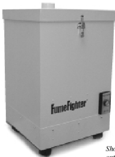
Shown with optional silencer