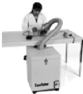
Shown with one optional arm