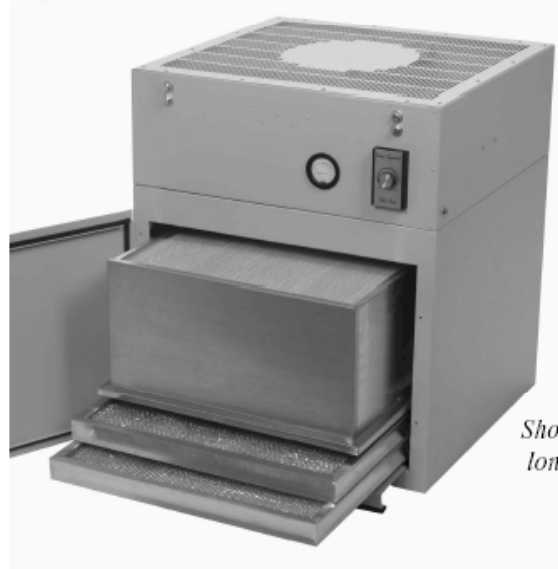
Shown with optional long life filter

Polluted air is drawn through the first stage mechanical mist impingers. The impingers are designed to remove larger mist droplets and particles. The remaining sub-micron mist droplets and particles are removed in the main filter. Clean air is returned to the environment. Installation is easy, just plug into outlet!